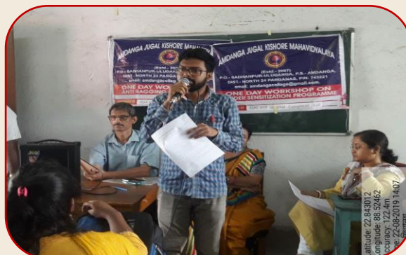
Workshop on ICC