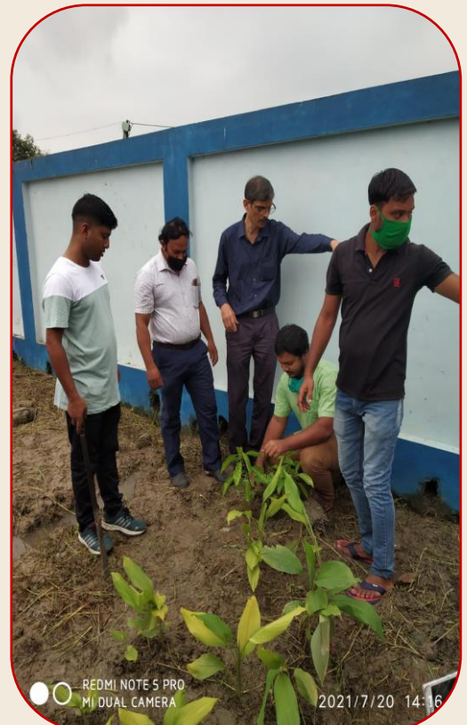
Tree Plantation by B.D.O