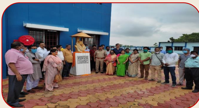
Unveiling the statue of Jugal Kishore Ghosh