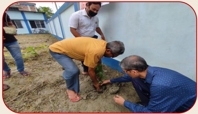
Tree Plantation by President (GB)