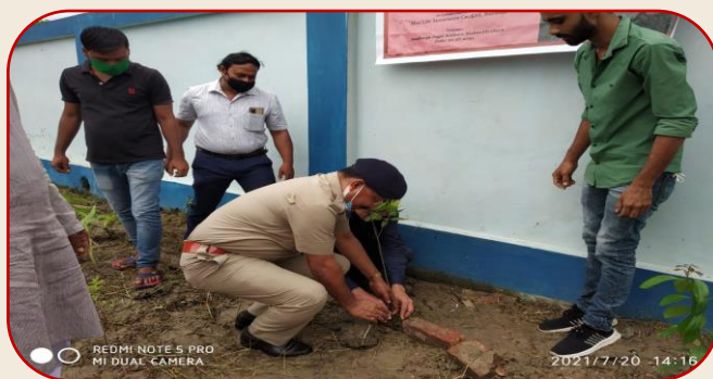
Tree Plantation by IC ( Police Station)