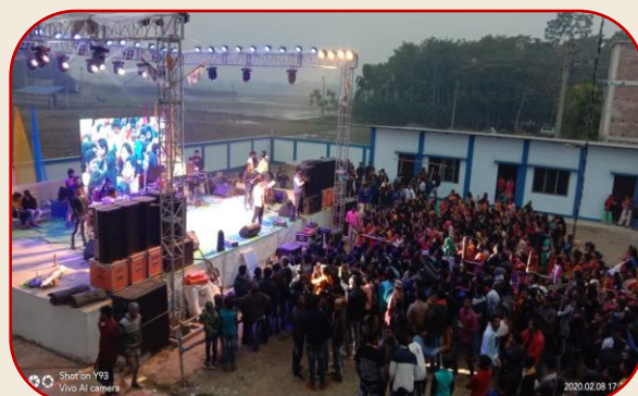
College Welcome Freshers