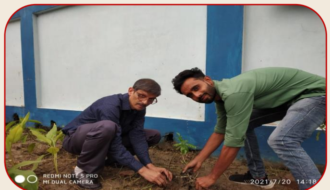
Tree Plantation by Principal