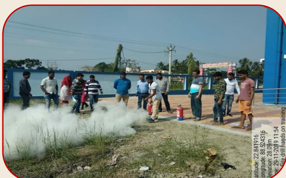
Training of Fire Extinguisher